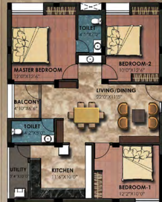
UNIT-E AREA = 1227.00 SQ.FT