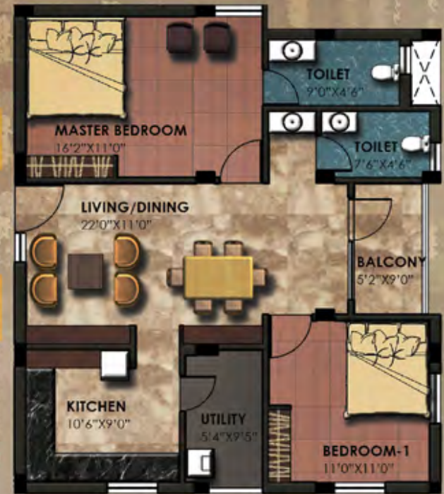
UNIT-F AREA = 1236.00 SQ.FT