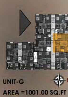
UNIT-G AREA = 1001.00 SQ.FT